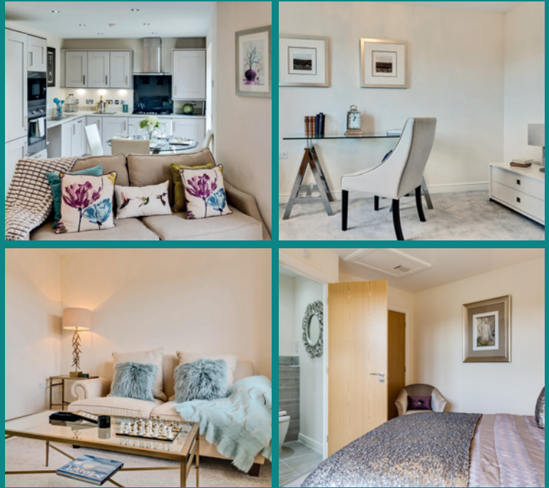
*Furniture is available to purchase via separate negotiation

The split-level Runswick offers a unique modern layout. Access the snug or study from the hallway, or take the stairs down to the open plan living room, and high specification kitchen. There are four double bedrooms split over two levels with the master bedroom featuring a luxury en suite on the top floor.